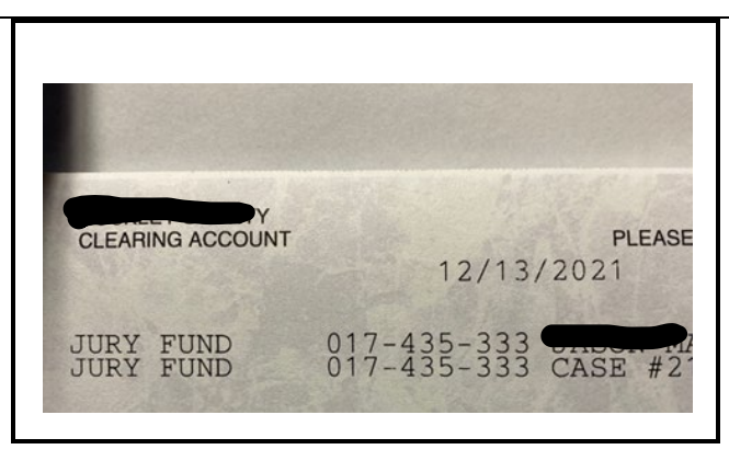
Figure 2. Investigator Payment Record

negligible funds for investigators, in several counties the information reported appears to be erroneous. One glaring example of this was found on an investigator's payment records from a county where their services were recorded as being from the "Jury Fund." The investigator does appointed work in this particular jurisdiction, but the TIDC data for this county identifies it as a jurisdiction with zero investigator expenditures.